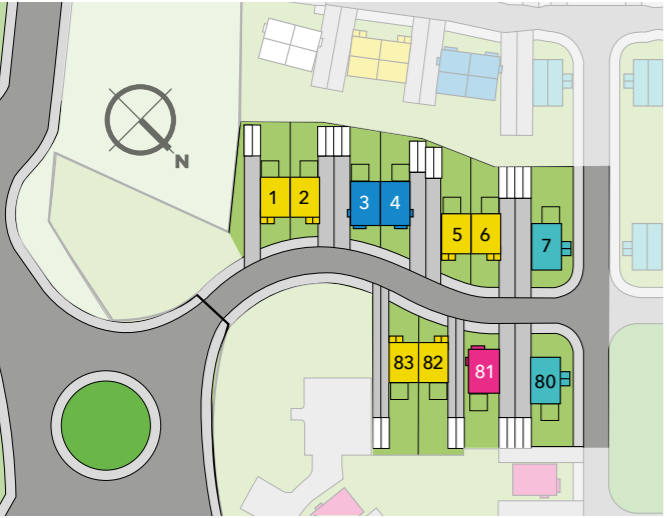
SITE LAYOUT - NOT TO SCALE

Plans are not to scale and all dimensions are approximate.